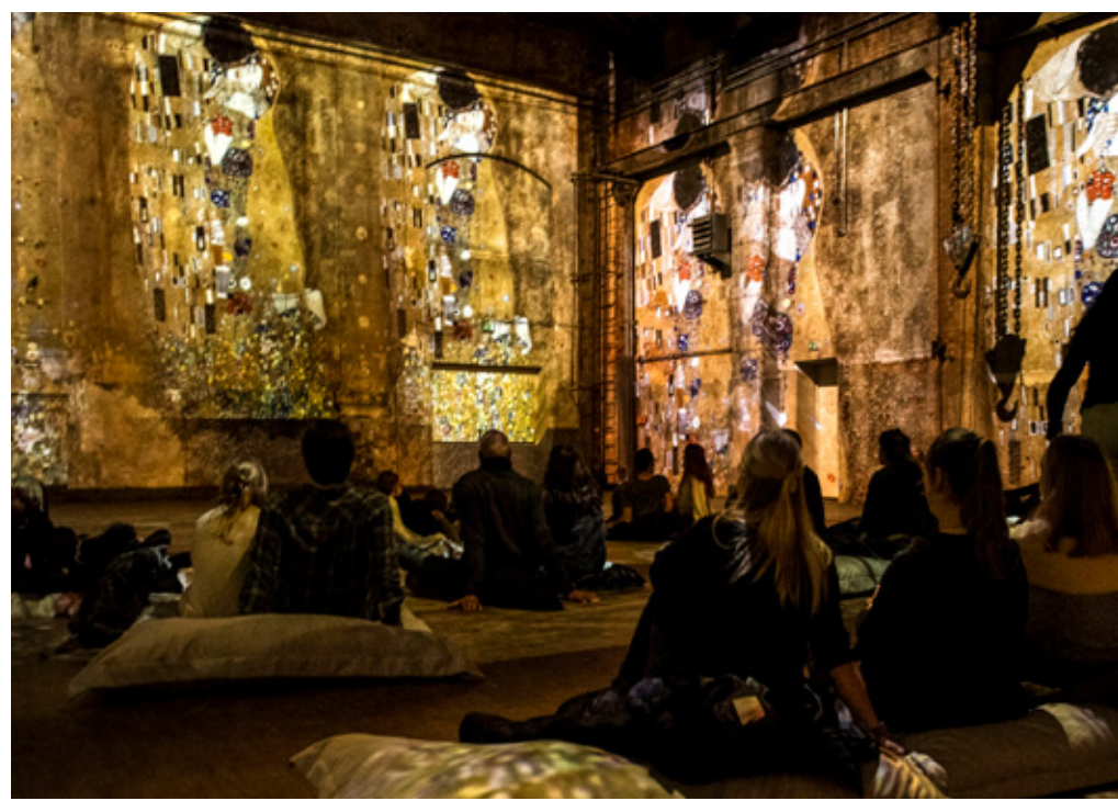
Kunstkraftwerk Leipzig Gustav Klimt - Gold Experience Immersive show

In the "Gold Experience", the audience moves between large rooms that can be experienced, multimedia installations, mirrored rooms, light sculptures, decorations and magnificent ornaments from the imperial era. The Italian creative studio created these immersive spaces, taking inspiration from the revolutionary artist's 'golden age'. The exhibition is a great opportunity to learn more about the artist who marked the beginning of modern painting at the end of the 19th century and gave a new face to the culture of his time.