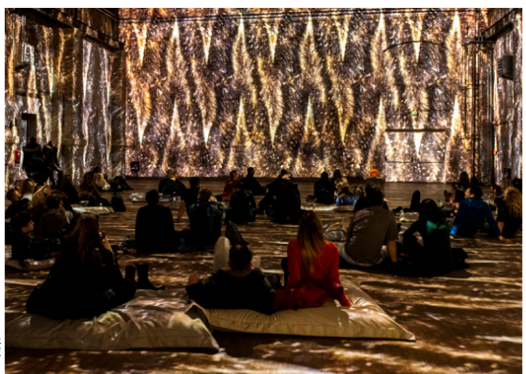
Kunstkraftwerk Leipzig Gustav Klimt - Gold Experience Immersive show

Divided into several themed areas, the exhibition pays tribute to Klimt's history and artistic career with immersive shows and installations inspired by his most famous works and spectacular painting techniques. The public experiences the exhibition as a course.